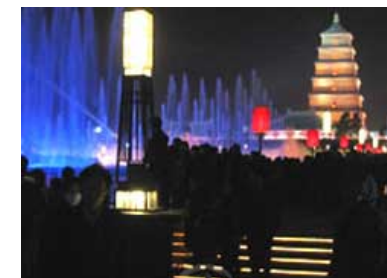
Big Wild Goose Pagod