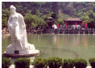
Hua Qing Hot Spring