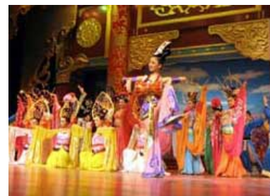
Tang Dynasty Dinner ShowTang Dynasty Dinner Show