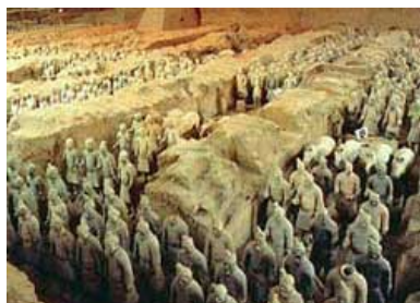
Terra Cotta Warriors and Horses

Xi'an, China's ancient capital with a history dating back more than 5,000 years has become a must-see location for many tourists visiting China. The mausoleum of Qin Shi Huang, the unifier of China and its first Emperor, is home to what has become known as "the Eighth Wonder of the World," the Terracotta Warriors. this tour is a great opportunity to learn and experience a great deal of the ancient history of China.